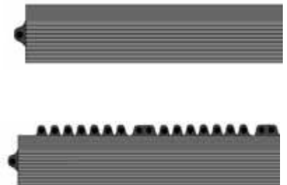
75mm x 990mm Female Ramp and Male Ramps

Uses: For use in wet, dry and greasy environments Compounds: 100% Nitrile Butadiene Rubber Durometer: 60 per ASTM D2240 Coefficient of Friction: 1.10 Dry 1.10 Wet per ASTM F1677 Tabor Abrasion: <1 % lost @ 1,000 cycles per Fed Std. 193 Flammability: "A" Rating per MVSS 302 Edging: Optional 75mm wide safety bevelled Thickness: 16mm Warranty: 1 year, conditional Colour: Mat - Black, Edging: Black or Yellow