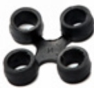
Black Connector (Sold seperately)